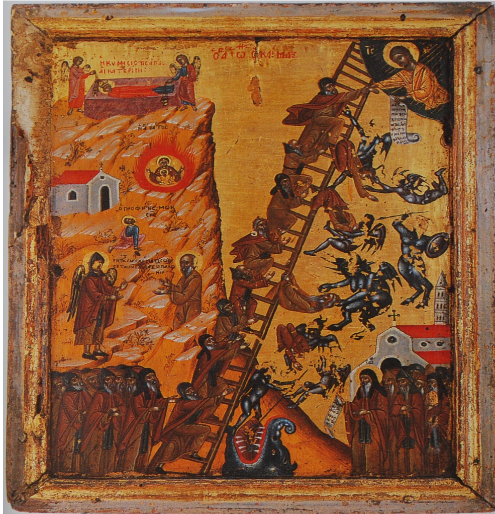
The Ladder of Divine Ascent - Saint John Climacus ✠ Η Κλίμακα του Παραδείσου - Όσιος Ιωάννης ο Συγγραφέας